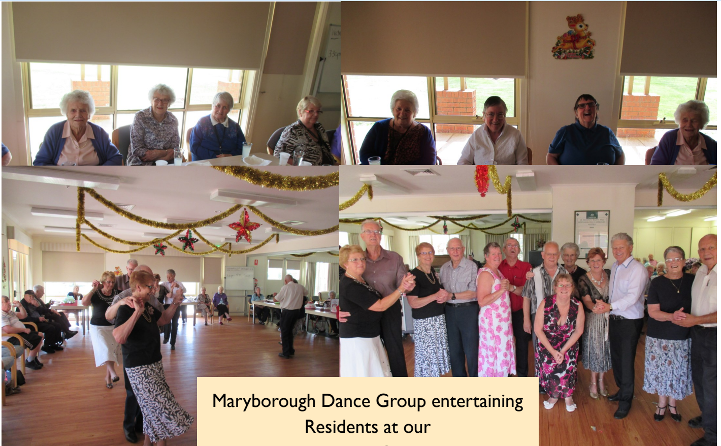
Maryborough Dance Group entertaining Residents at our New Years Eve Celebration.