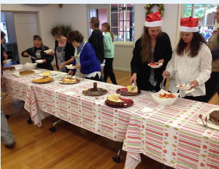
Everyone loved the wide selection of the yummy desserts