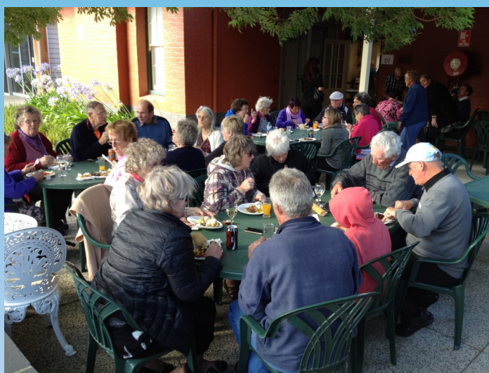
The weather was accommodating and the rain held off