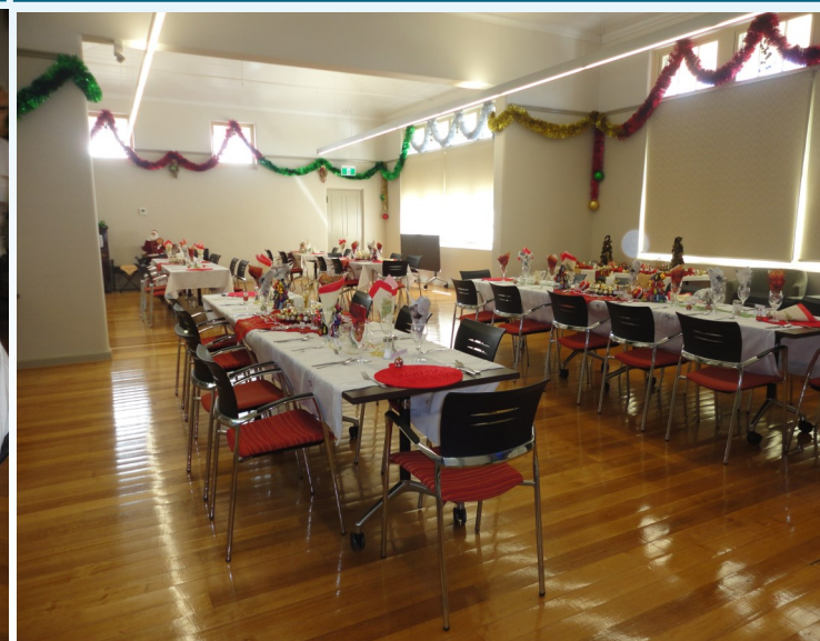
The Community Centre Decorated ready for Christmas