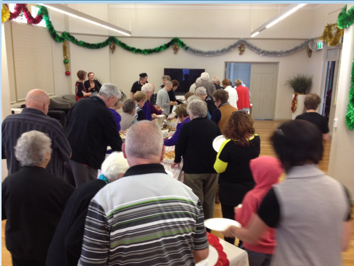
Residents enjoy the lovely array of food on offer