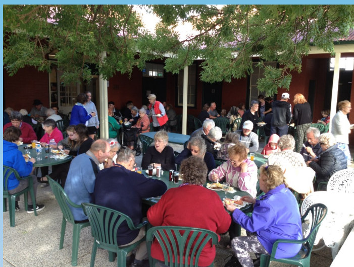
Residents, Family Friends enjoying the Christmas BBQ