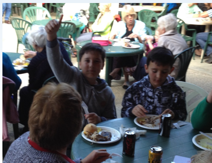
The foods gets the thumbs up