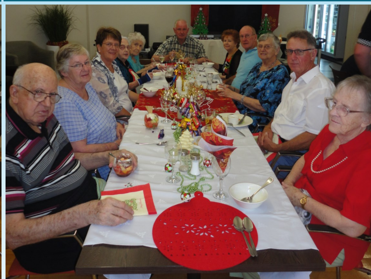
Residents Family and friends come together for Christmas at Raglan House