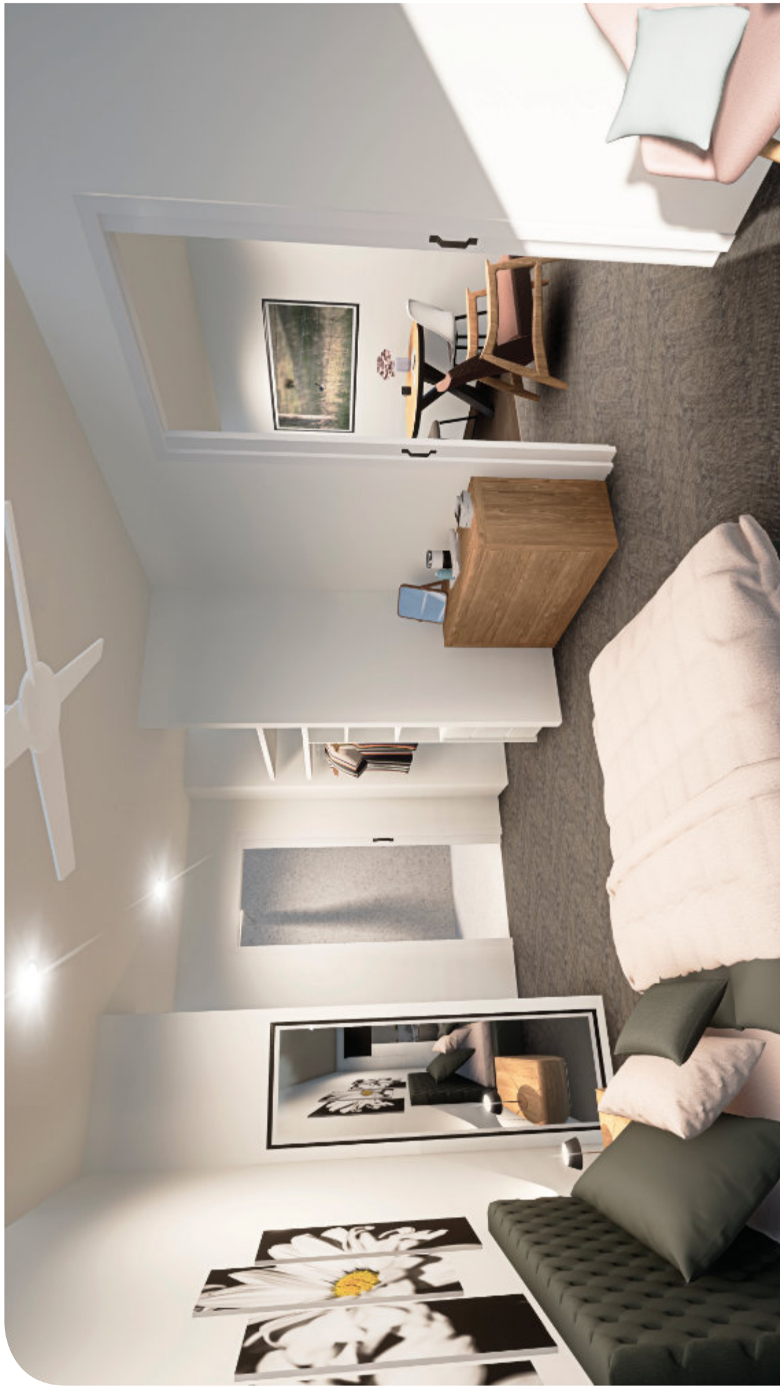
Bedrooms are spacious and adjoining walk in robes have extraordinary storage room. Some units have larger bedrooms for couples. Walk-through robes lead to an ensuite bathroom which creates a sense of space and privacy for superior comfort.