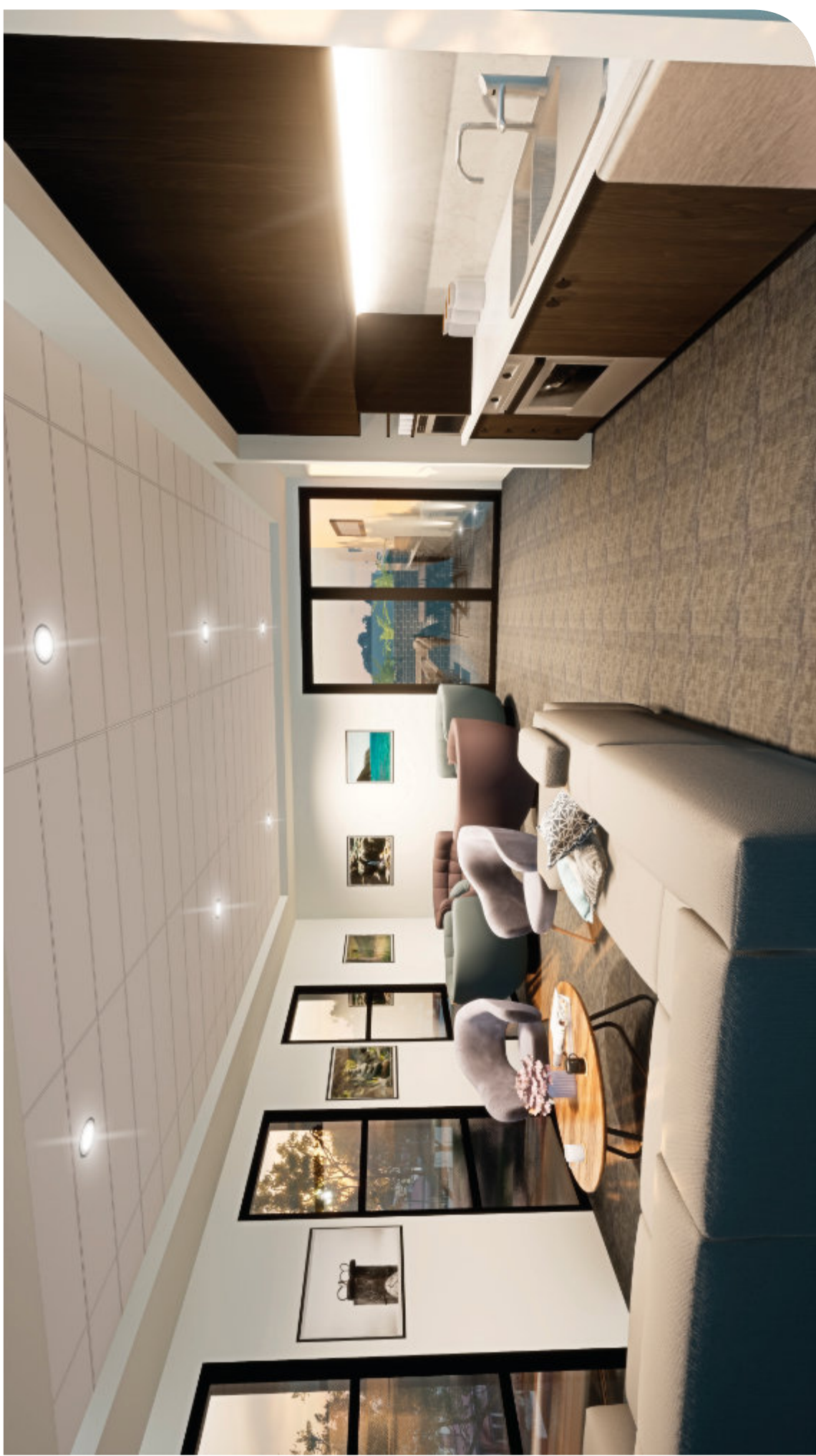
The lounge with view to adjoining balcony, ideal for functions and family gatherings, or for just relaxing with new friends.