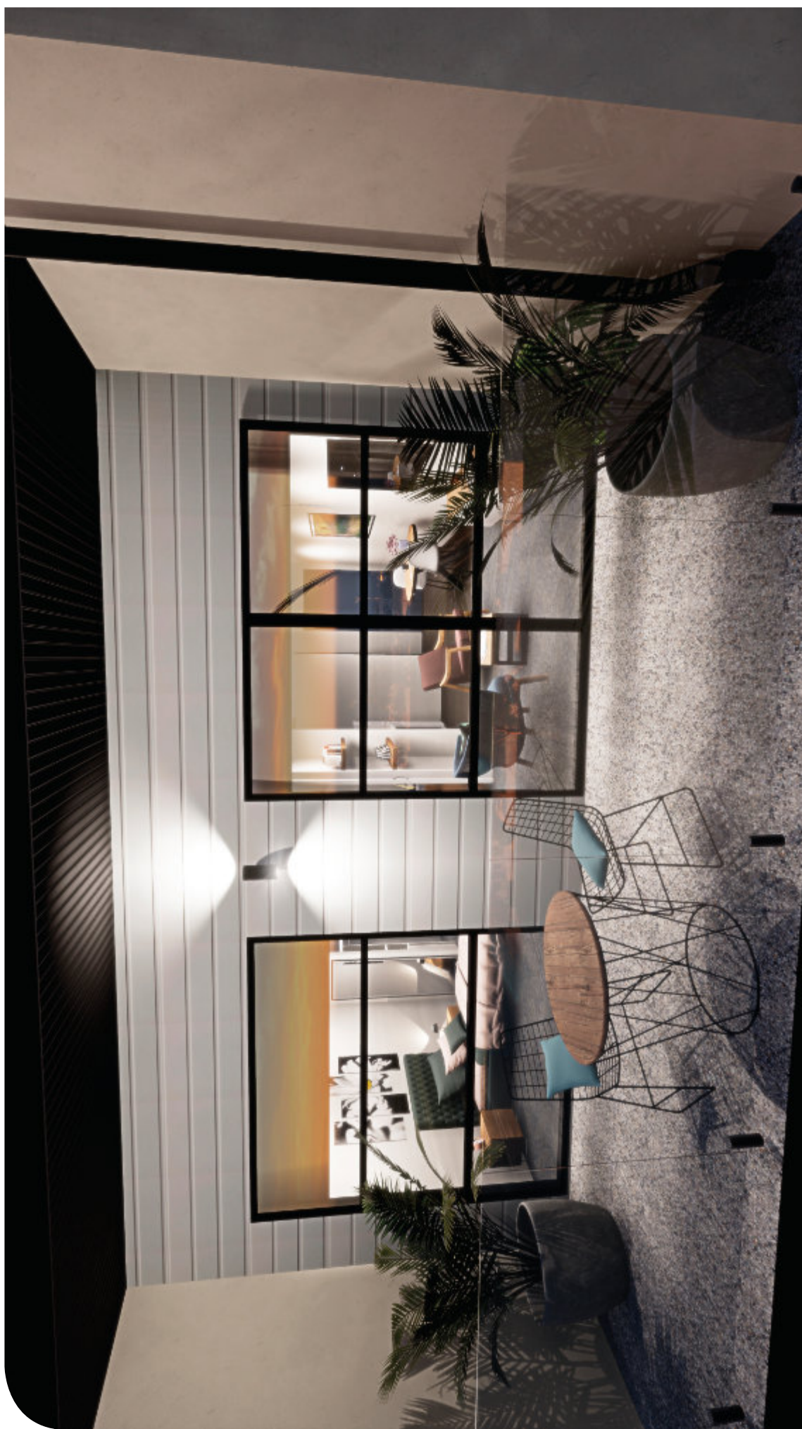
Each unit has its own private balcony for relaxing outside or creating your own private garden. This is the view looking back into your kitchen/ lounge and bedroom from the balcony.