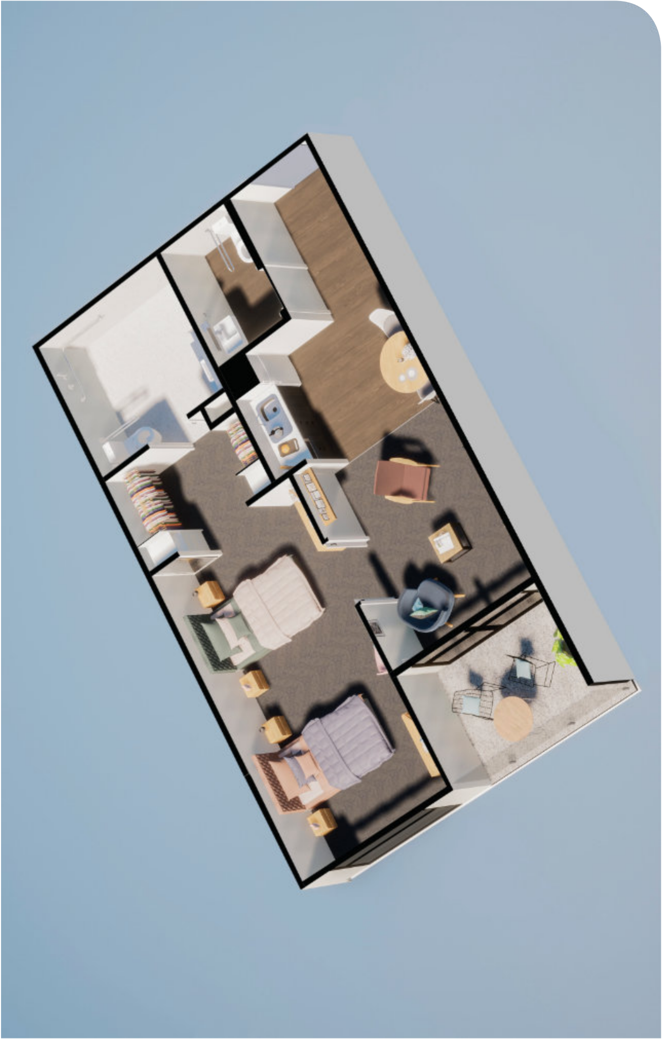
Apartment view, twin bedroom.