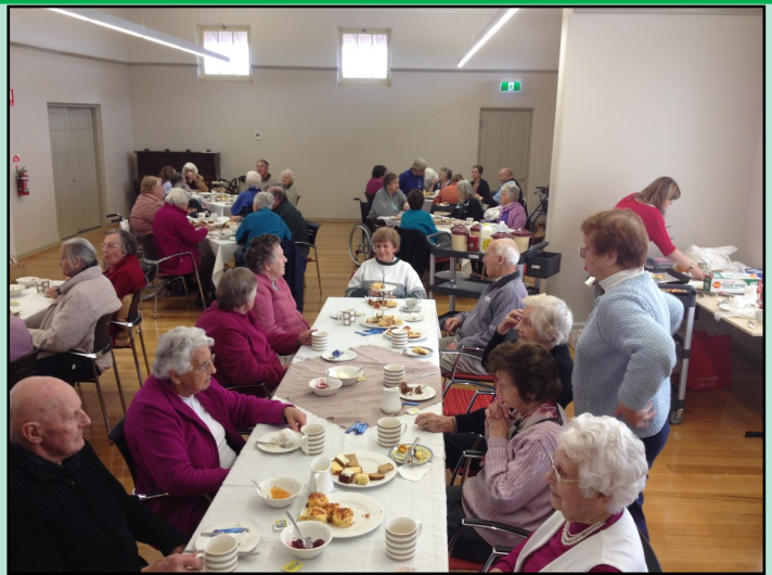
Raglan Residents and their Shire Guests