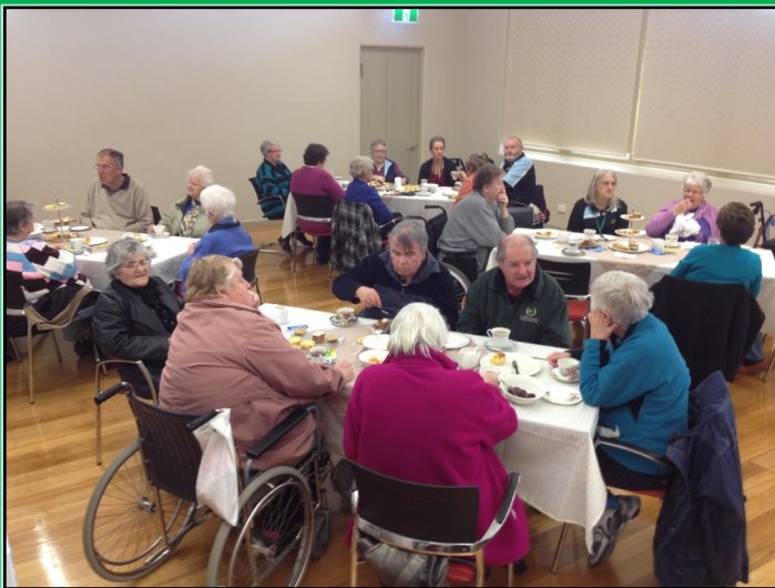
The Shire Activity Group enjoying High Tea